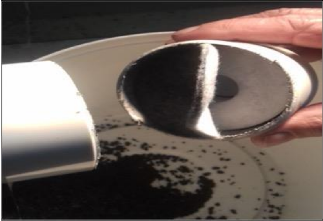
Figure 1: Prototype filters were tested with different types of polypropylene filter elements, which were used inside the filter chamber with the objective of retaining solid material to not pollute the environment, allowing high flow and low-pressure loss