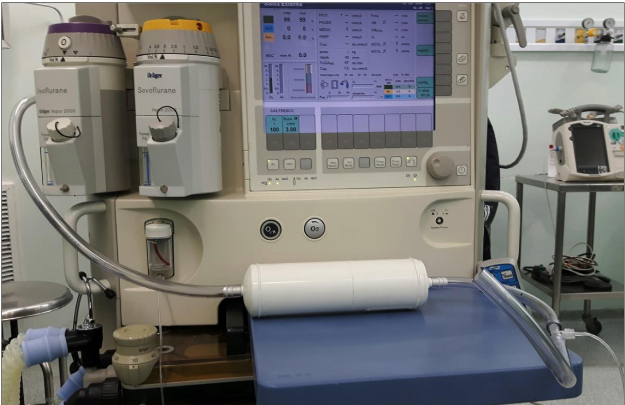
Figure 3: Tests were performed using the gas outlet of the Dräger® anesthesia machine, Primus model